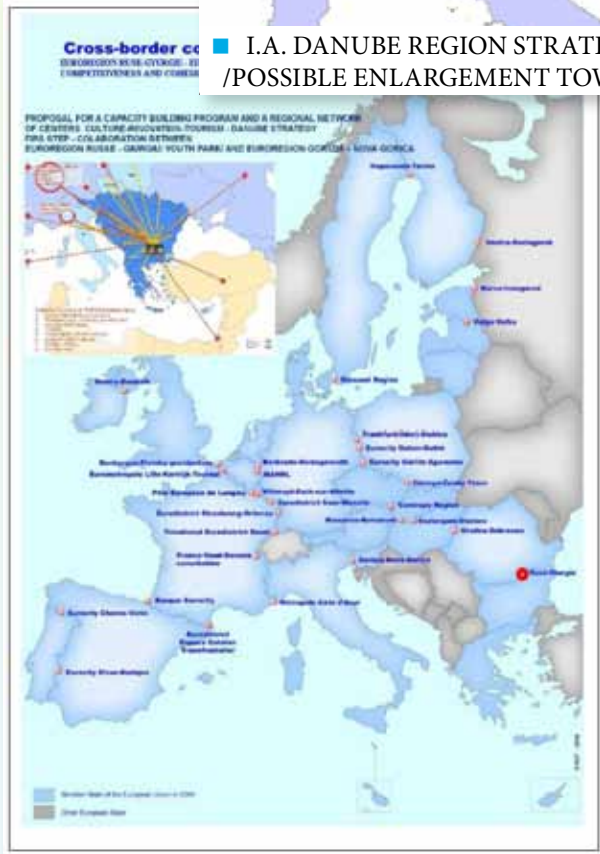
I.D. CROSS-BORDER CONURBATIONS AND EURODISTRICTS